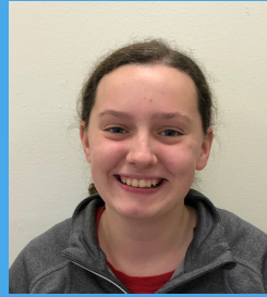
7th- Jade Peak